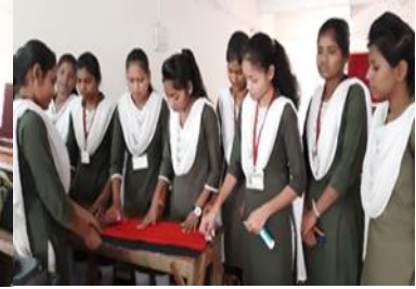
Students Making Files and Folders