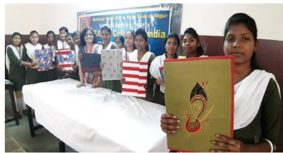
Exhibition of File and Folder