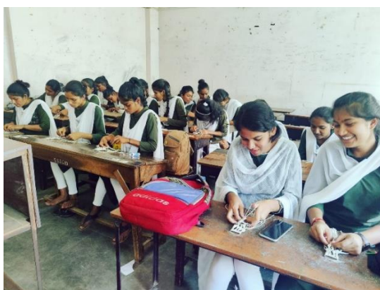
Students making keychains