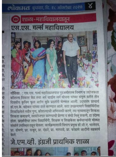
News Paper cutting of the Exhibition