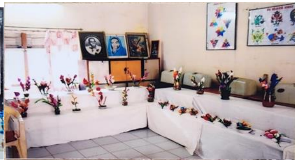
Display of Flower Decorations