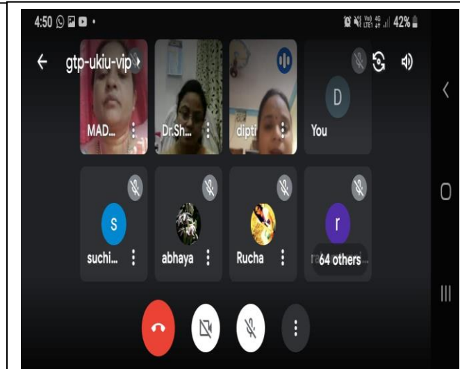
Participant of the National Seminar (online) on dated 07/08/2021