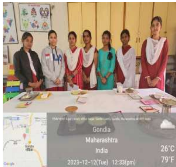
Cooking Competition on Therapeutic diet for various disease patients