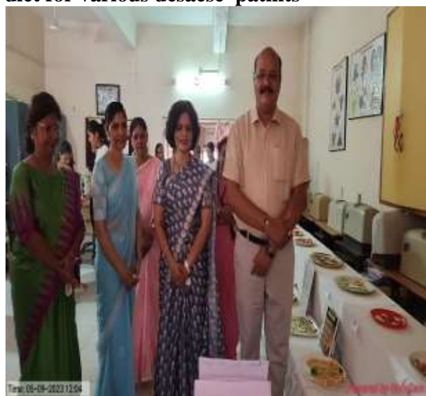
Healthy Salad Decoration competition