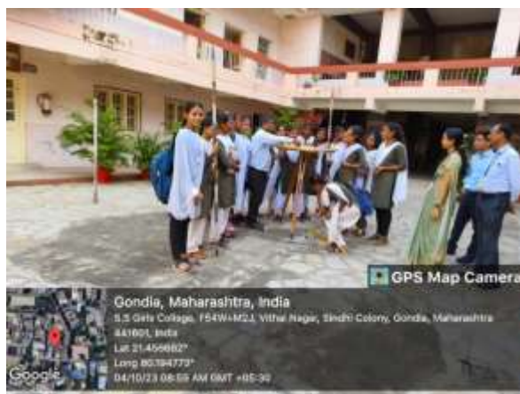
Plain Table Survey By B.A. III rd semester students

Gondia, Maharashtra, India S.S. Girls College, F54W+M2L Vitthal Nagar, Sinhli Colony, Gondia, Maharashtra 441601, India Lat: 21.456682° Long: 81.794773° 04/10/23 08:59 AM GMT +05:30