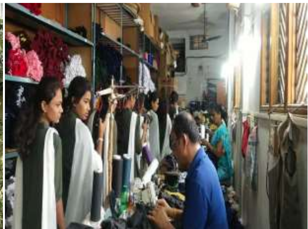
Education Visit at Shyam Hositex Aamgaon

Latitude: 21.364179 Longitude: 80.372190 Elevation: 343.76±2 m Accuracy: 4.4 m Time: 03-02-2024 11:48 Note: Industrial visit to Shyam Hositex