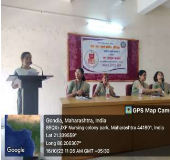
Gondia, Maharashtra, India 85QX+JXF Nursing colony park, Maharashtra 441801, India Lat 21.339559° Long 80.200307° 16/10/23 11:26 AM GMT +05:30

(Re-accredited (4 th Cycle) B + By NAAC, Bengaluru)