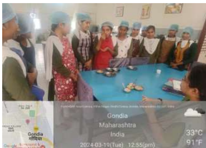
Sensory Evaluation By Students

Experimental or practical learning is a teaching method in which students acquire knowledge and skills by operating comprehensively to investigate and respond to an authentic, engaging, and complex question, problem, or challenge. Practical learning is an excellent tool because it challenges students to work together and think in new ways. It is an ideal technique for delivering numerous options for students with various learning choices.