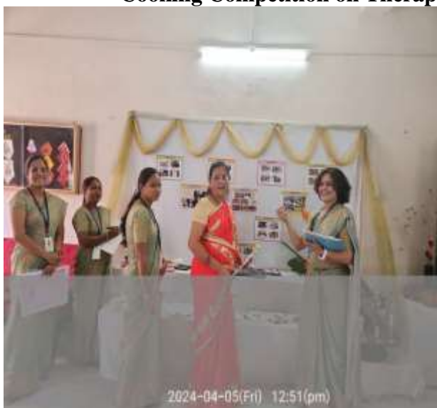
Cereals cookery competition