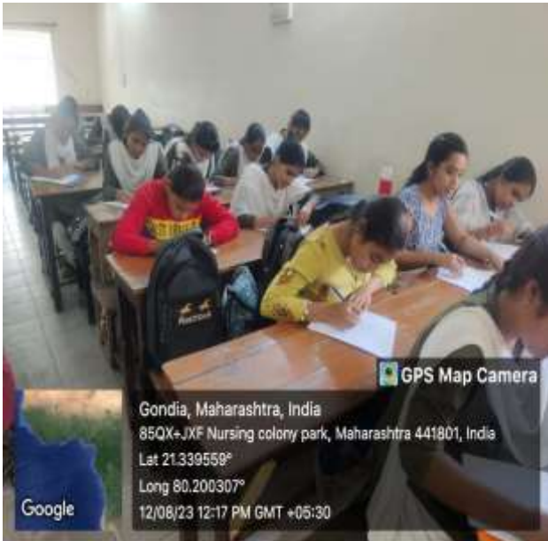
Gondia, Maharashtra, India 85QX+JXF Nursing colony park, Maharashtra 441801, India Lat 21.339559° Long 80.200307° 12/08/23 12:17 PM GMT +05:30