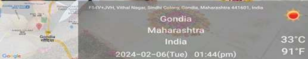
Workshop & Competition on Types of Floor Decoration