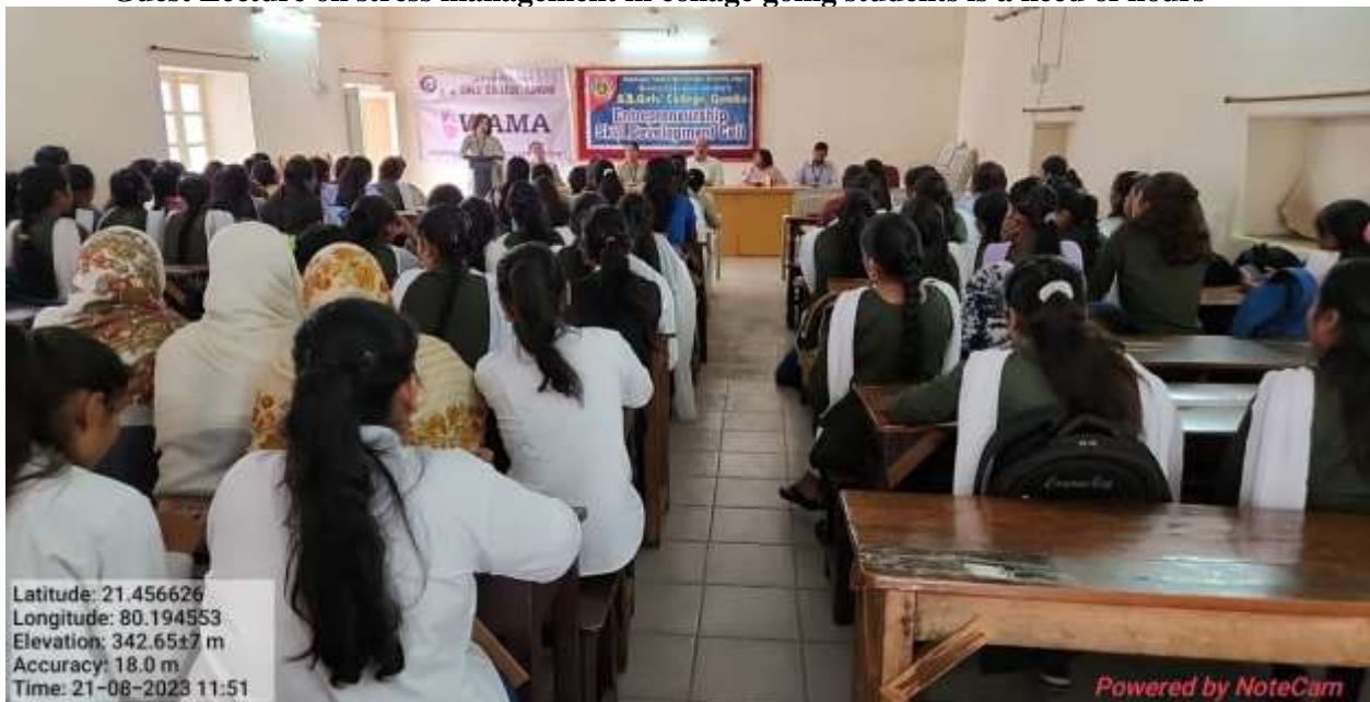
Motivational speech by Successful Entrepreneurs