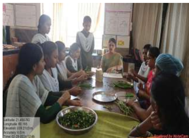
Work simplification by B.Sc. III rd year Students