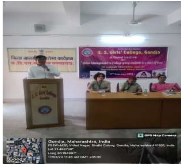
Guest Lecture on stress management in collage going students is a need of hours