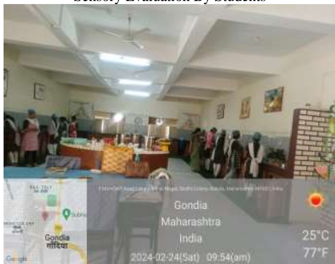
Cooking of whole day diet plan by students