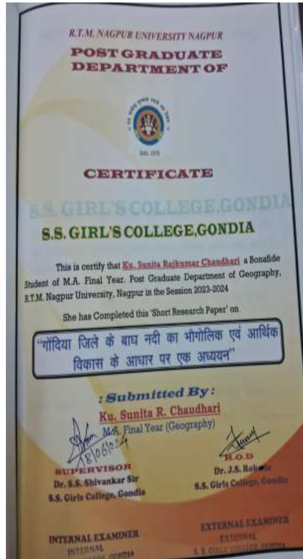
Short Reaserch Projects