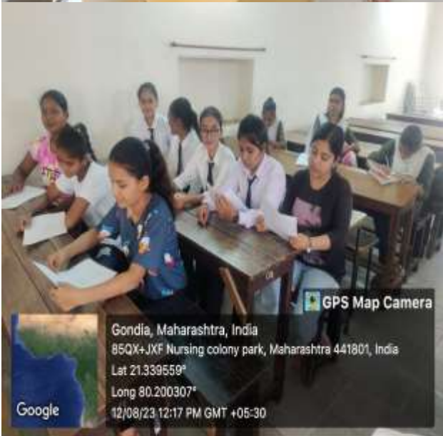
Gondia, Maharashtra, India 85QX+JXF Nursing colony park, Maharashtra 441801, India Lat 21.339559° Long 80.200307° 12/08/23 12:17 PM GMT +05:30