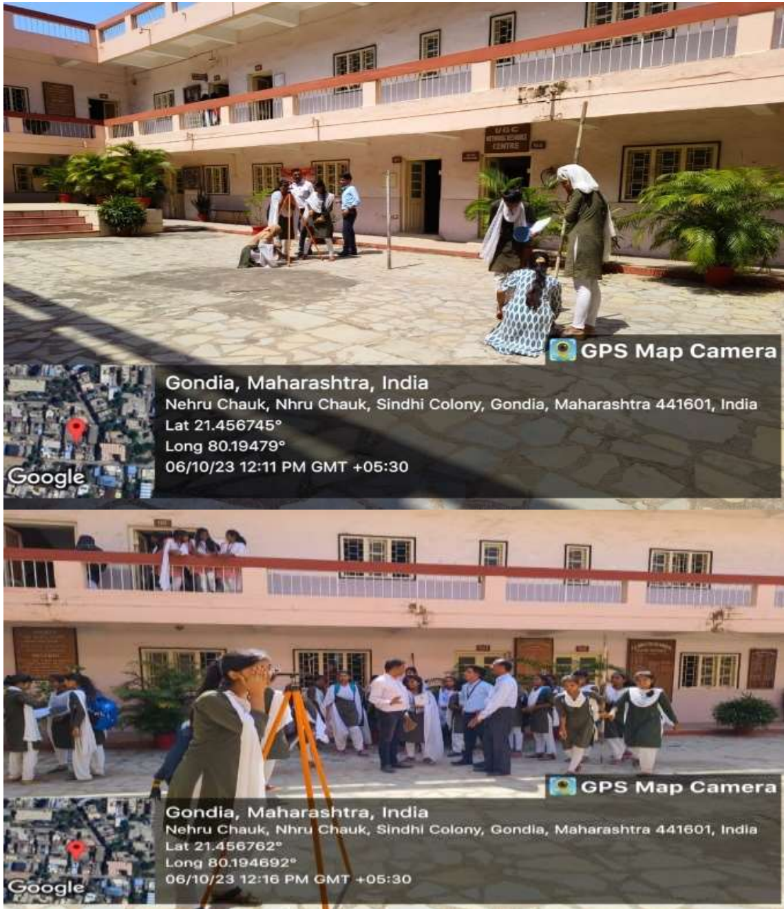
Dumpy Level Survey By B.A. V th semester students

(Re-accredited (4 th Cycle) B + By NAAC, Bengaluru)