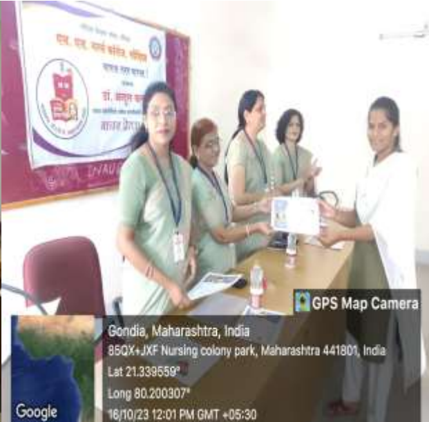
Gondia, Maharashtra, India 85QX+JXF Nursing colony park, Maharashtra 441801, India Lat 21.339559° Long 80.200307° 16/10/23 12:01 PM GMT +05:30